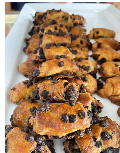
Chocolate chip rugelach

Holey Moley Golf Club, the immersive indoor mini-golf destination known for its over-the-top food and beverage offerings, is now offering The Giant Burger at the Santa Monica location on the Promenade. The massive 5-pound burger