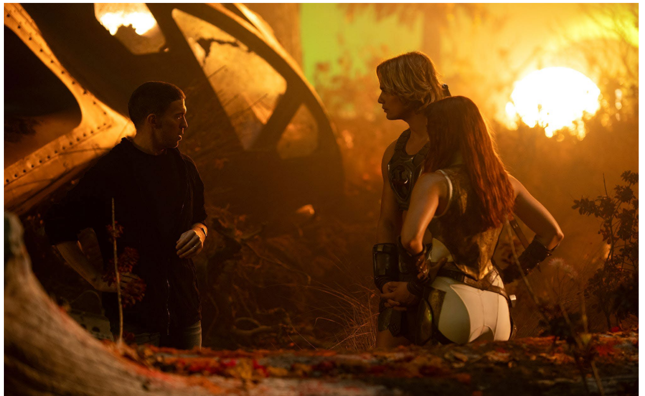
Travis Knight behind the scenes with Nicholas Galitzine and Camila Mendes

If all goes well, we could be in for more