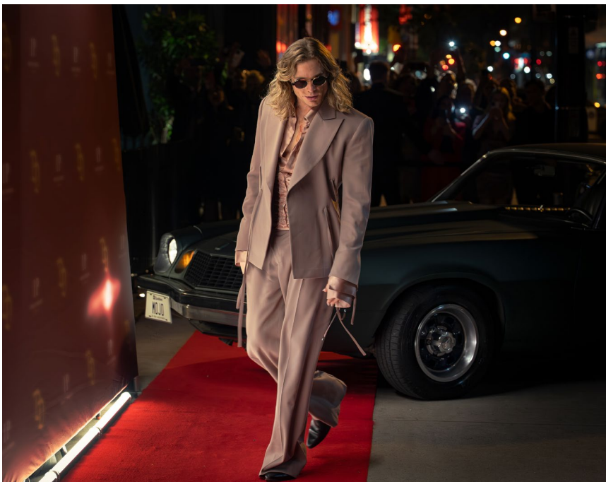
Lestat gives “the paps my pussycat.”