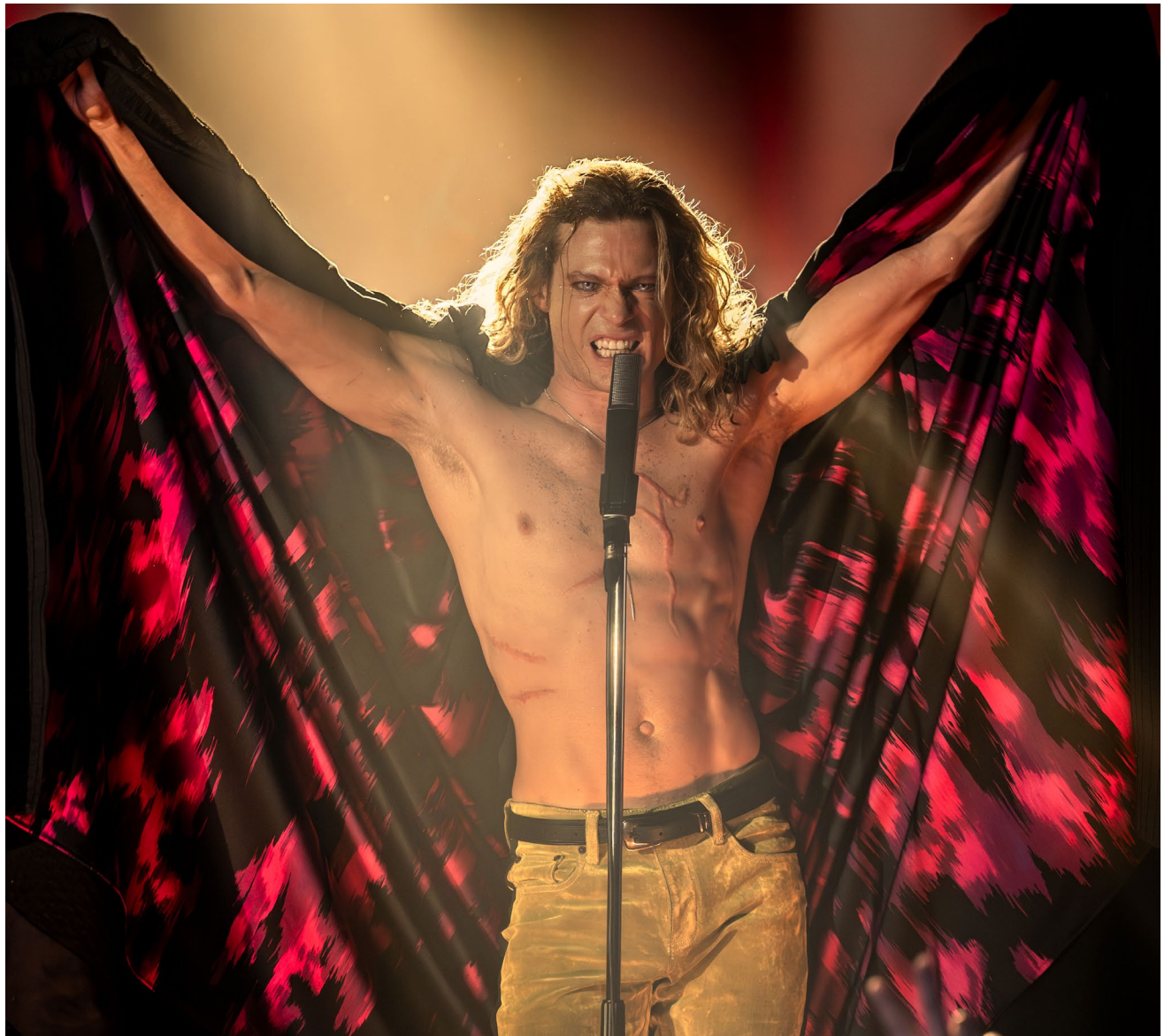
Sam Reid as Lestat de Lioncourt in "The Vampire Lestat"