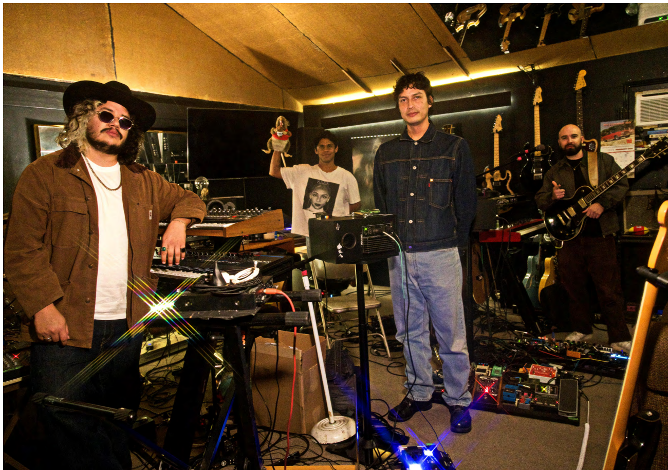
Inner Wave in studio