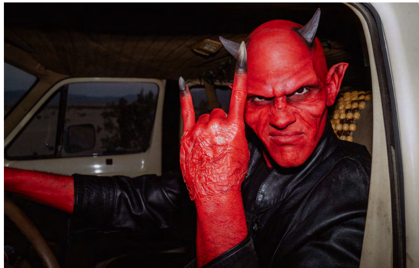
Behind the scenes of "See You When I Get Back"