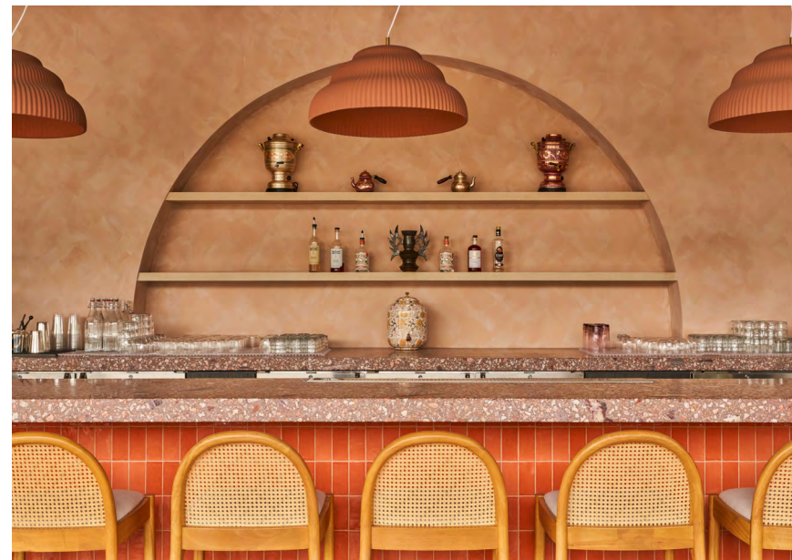
Compass Rose Interior