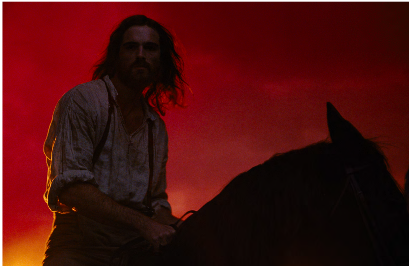
Jacob Elordi in “Wuthering Heights”

Emerald Fennell’s adaptation of Wuthering Heights is a rip-roaring, bodice-ripping romance that centers on differences in class structure, gold diggers, marital abusers, and two of the most reprehensible characters in movie history. Happy Valentine’s Day, folks! Marketed as “the most romantic story ever told,” it might very well be the least romantic. As Emily Brontë wrote (with wonderful prose) of her immoral lovers, whatever their souls are made of, they are made of the very same thing — judging by these self-centered twats, that thing is mold.