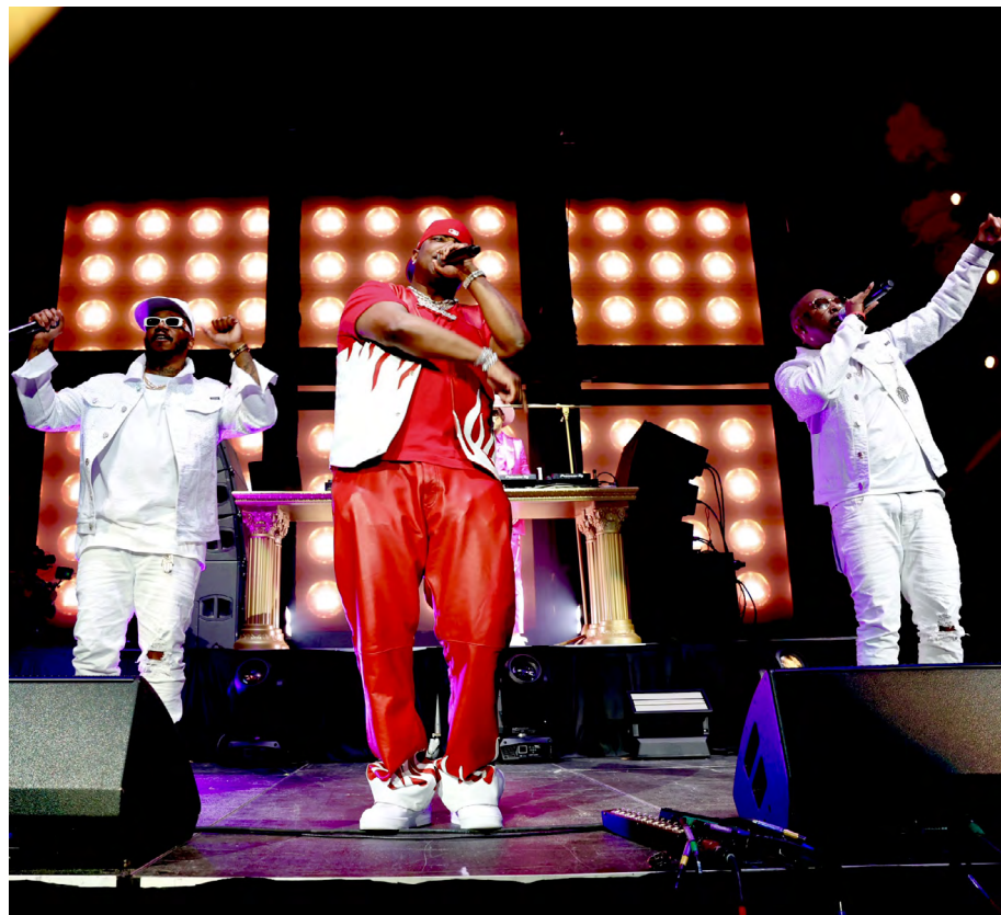
DJ Cassidy’s Pass the Mic Live!

On Valentine’s Day in Los Angeles, the celebration came home. 🎧