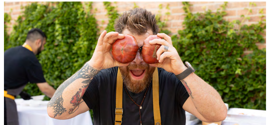
No Kid Hungry