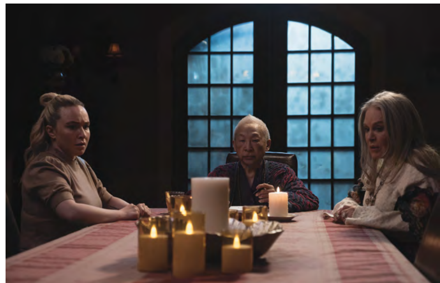
Scenes from "Sleepwalker"