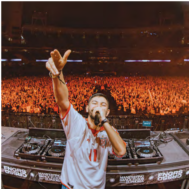
KEIKI KNUDSEN @IMKEIKI