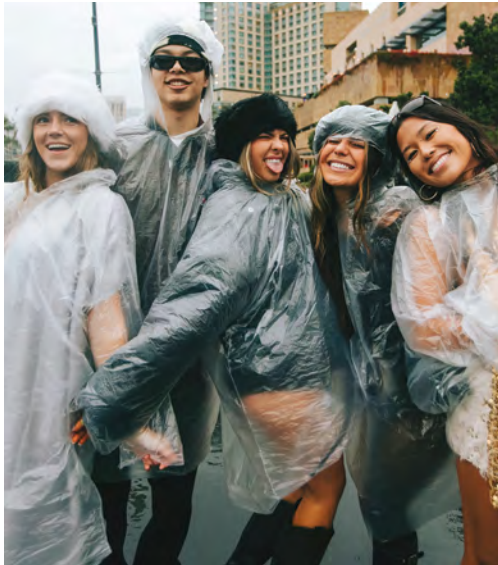
GINA CHONG @GINAJOYPHOTO