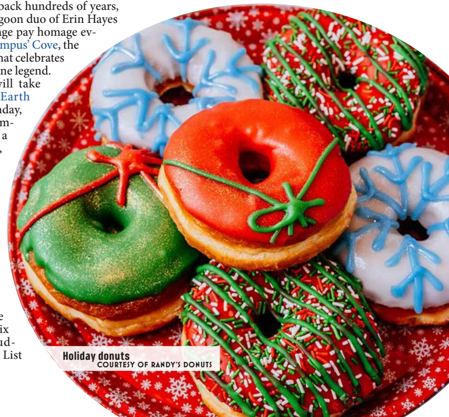
Holiday donuts COURTESY OF RANDY'S DONUTS

Negroni, Merry Axe-Mas, and Grinches Need Love, Too. Tickets and more info on Eventbrite . 📍