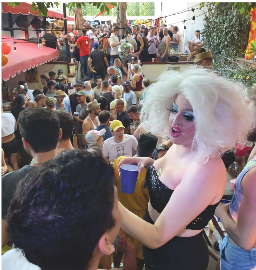
Hot Dog Sundays