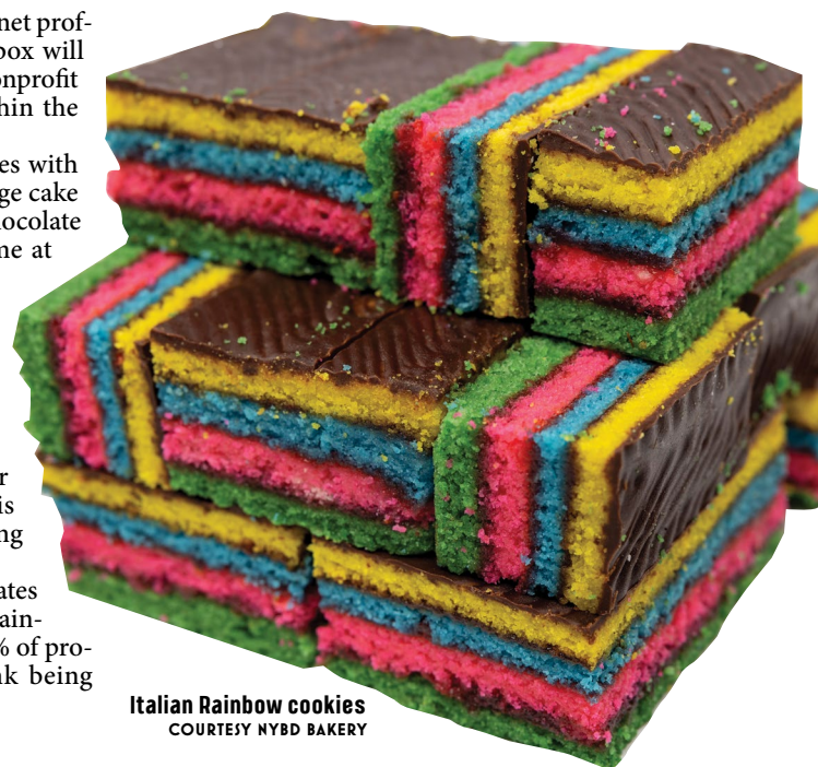
Italian Rainbow cookies

This June, The Garland celebrates Pride with a vibrant lineup of rainbow-inspired cocktails, with 15% of proceeds from each featured drink being donated to The Trevor Project .