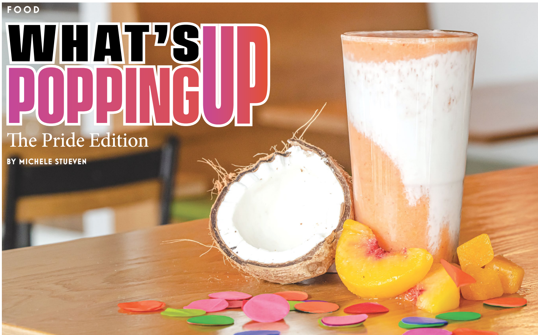
Veggie Grill's Peachy Passion Pride Smoothie

The Maybourne Beverly Hills will feature a cocktail recipe for June, with a portion of the proceeds going to an LGBT charity, the Human Rights Campaign. The drink will be made with Cincoro Tequila, which is owned by Michael Jordan, Jeanie Buss, Serena Williams, and other notable sports personalities.