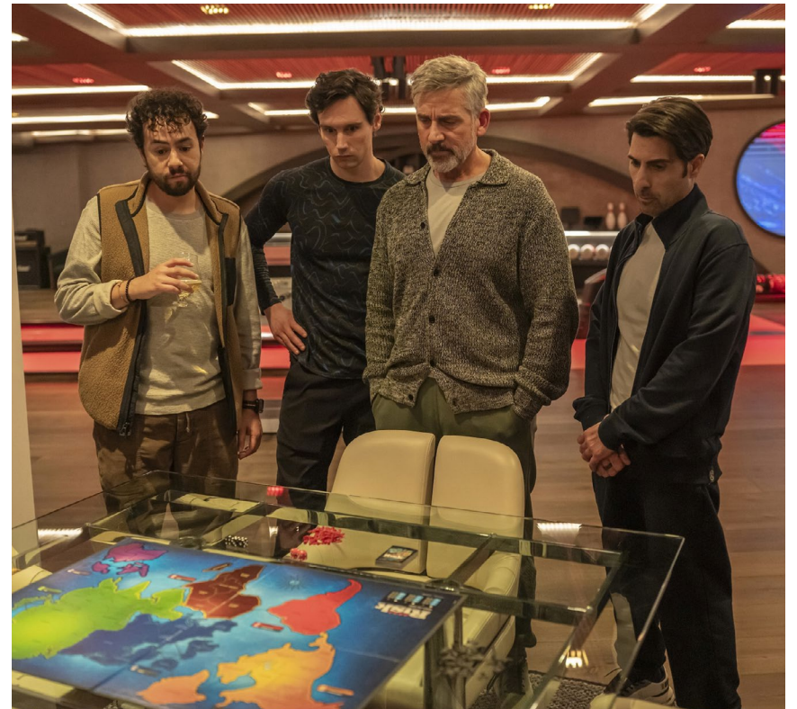
Ramy Youssef, Cory Michael Smith, Steve Carrell and Jason Schwartzman star in “Mountainhead”

absurdist riff on Jean-Paul Sartre’s No Exit for the Patrick Bateman sect. Overall, the execution as a four-hander plays well due to the tight, rhythmic cadence between the actors as the cast performs like a finely tuned, morally bankrupt machine. Each actor escalates the cartoonish villain to glorious heights, but there are times when their toxic masculinity and bro-culture mentality become wearisome to watch.