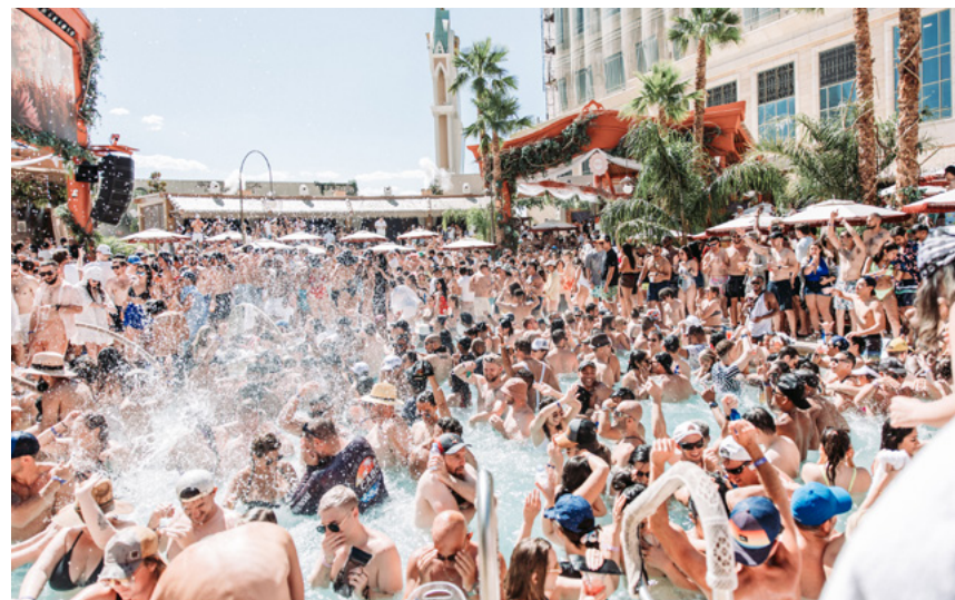
TAO Beach Dayclub