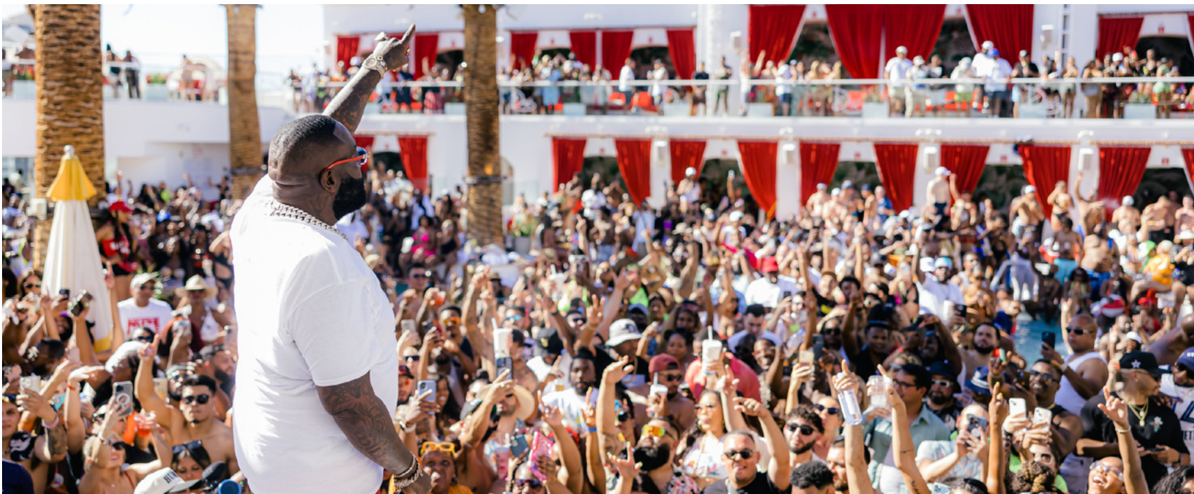
Rick Ross at Draï's