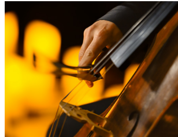
CANDLELIGHT CONCERT SERIES IN LOS ANGELES