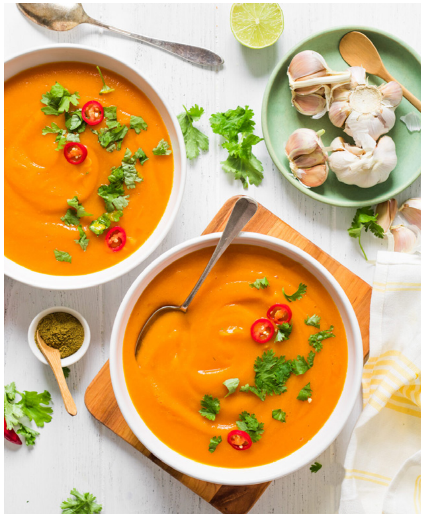
SPICED SQUASH SOUP

heat lamps and cooling misters for the summer months. The opening menu includes black garlic charred octopus, slow braised lamb shank, a signature Olivia Burger with pan-fried onions, bone marrow aioli, and house-made pickles, as well as house-made pastas and prime cuts like a 34-oz Tomahawk Ribeye.