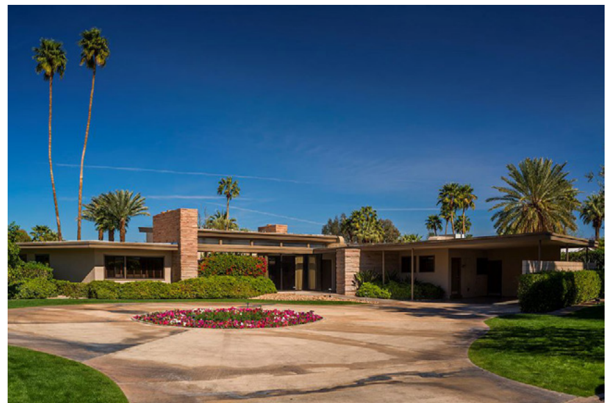
FRANK SINATRA TWIN PALMS ESTATE