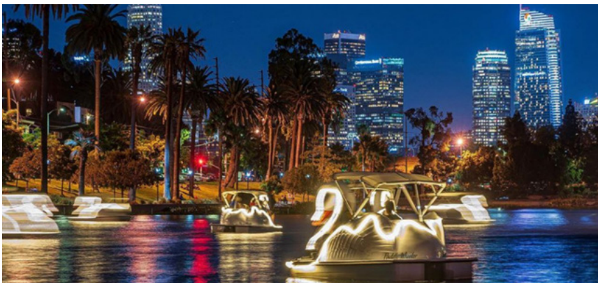
SWAN BOATS IN ECHO PARK