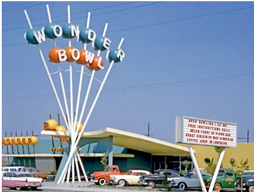
BOWLARAMA THE ARCHITECTURE OF MIDCENTURY BOWLING

transformed the landscaping and interiors, honoring Frey's signature architectural elements while adding playful nods to the Batman legacy including the sleek curves of the "Bat Cave," with modern forms, warm hues and the trademark Batman black edge.