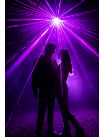
ASTRA LUMINA