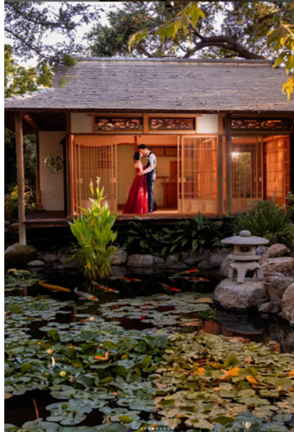
STORRIER STEARNS JAPANESE GARDEN