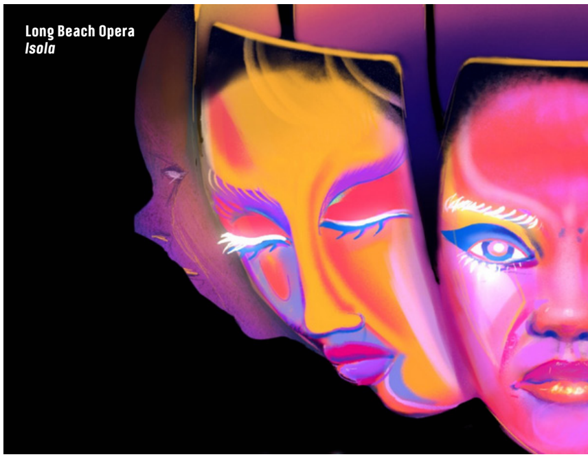
Long Beach Opera Isola

industrial cities, tourist-driven regions, and pastoral villages, sketching critical, speculative, and sobering perspectives that allow viewers to interrogate what unfolds around us. 631 W. 2nd St., downtown; Monday, February 5, 8pm (live and streaming); $12; redcat.org.