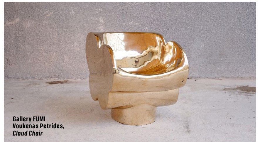
Gallery FUMI Voukenas Petrides, Cloud Chair